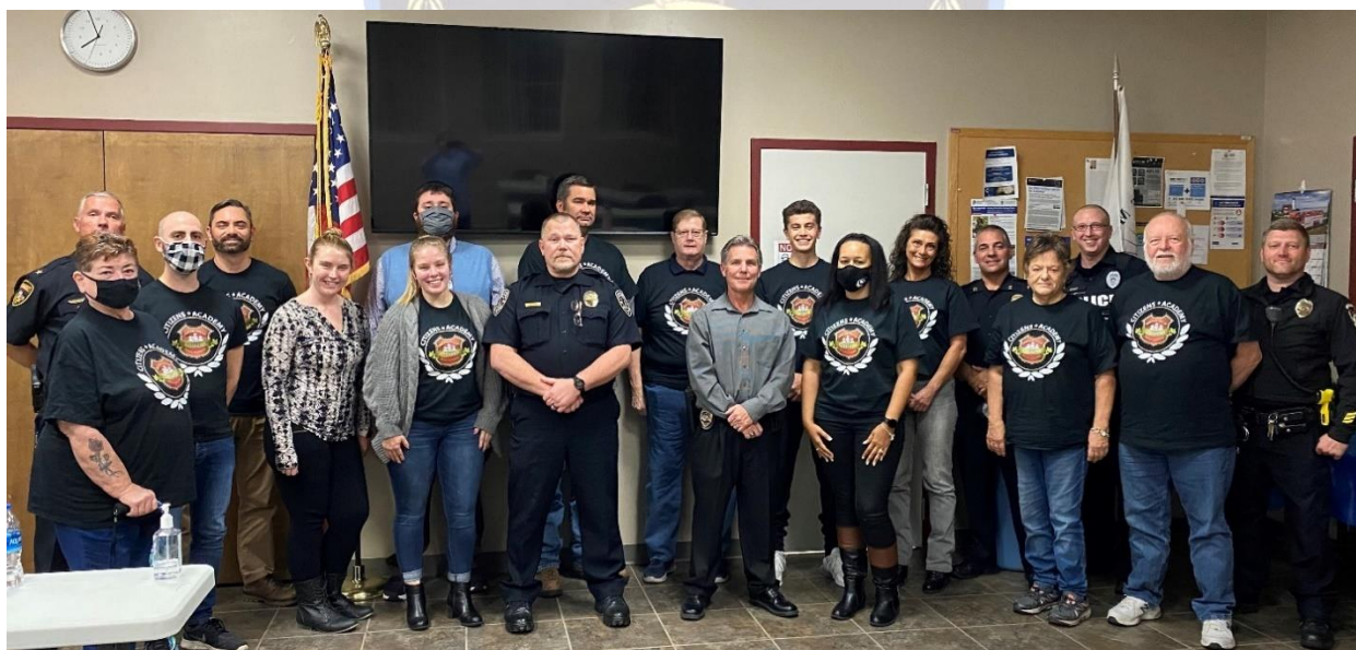
2021 Citizen's Police Academy Graduation