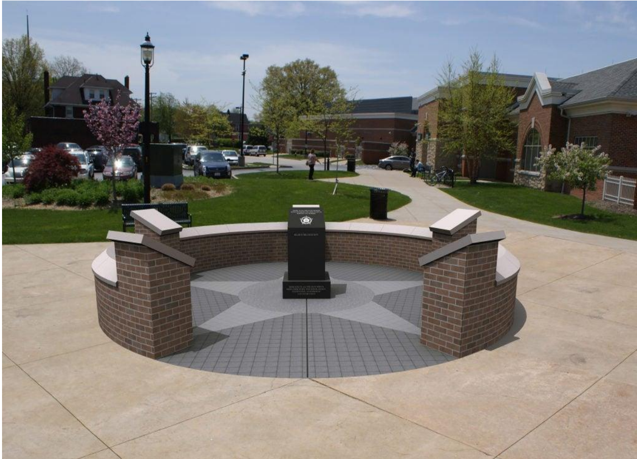
Cuyahoga Falls – Silver Lake Police Memorial

The Cuyahoga Falls and Silver Lake Police Memorial and Honor Guard Foundation honors past and present members of the police departments and encourages community awareness. The Memorial is located at the Cuyahoga Falls Civic Center Campus as seen below. The Memorial honors officers killed in the line of duty, those killed while serving in the military, as well as deceased, retired officers of the communities they served. For more information visit: http://cfslpolicememorial.org/