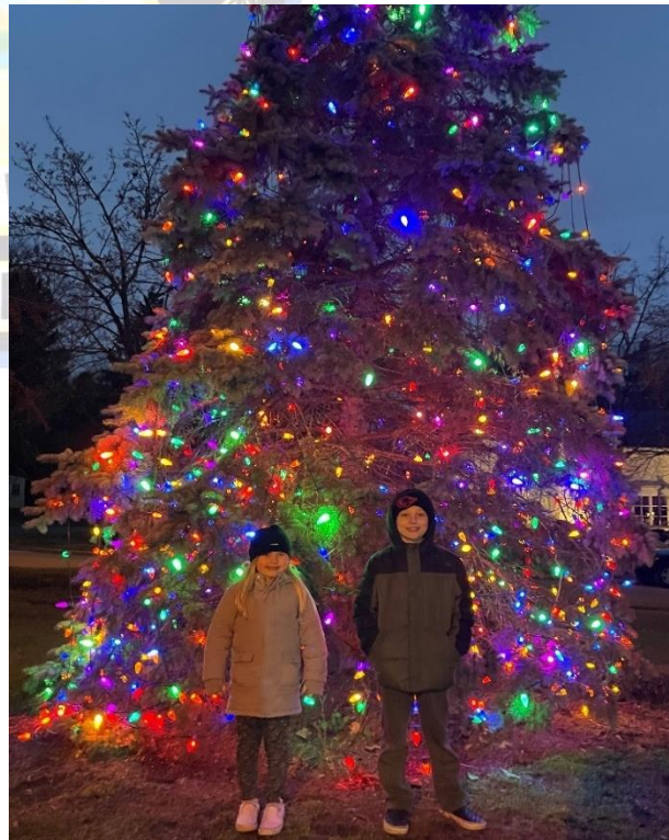
Christmas Tree lit for the holidays