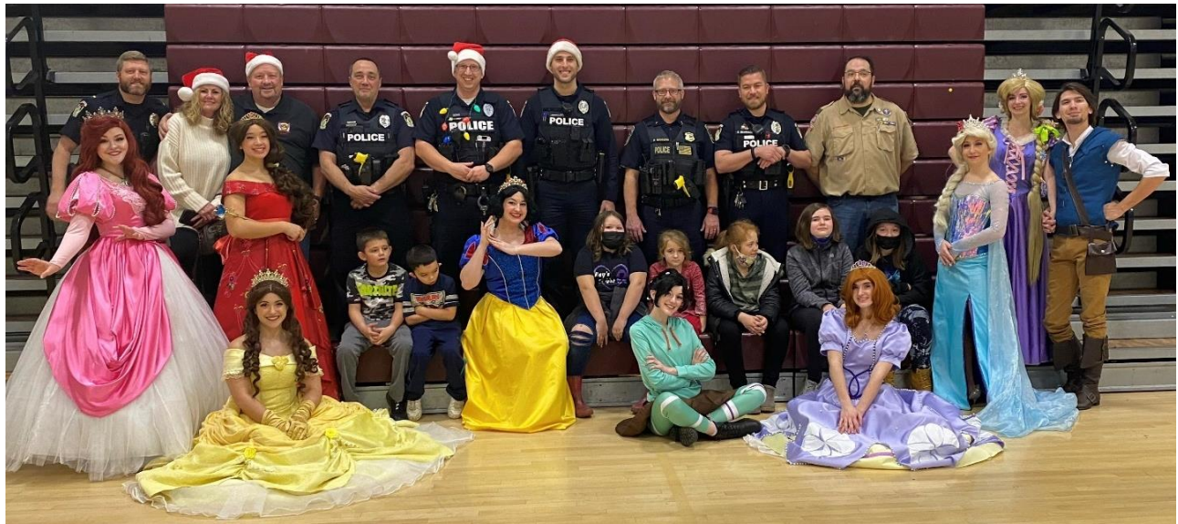
2021 Shop with A Cop – Silver Lake Police Department Group Photo