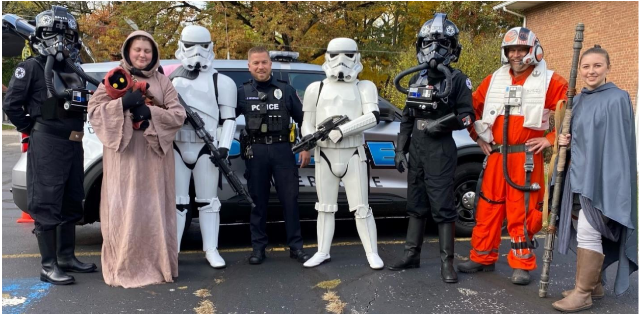
Ofc. Beverage along with members of Star Wars