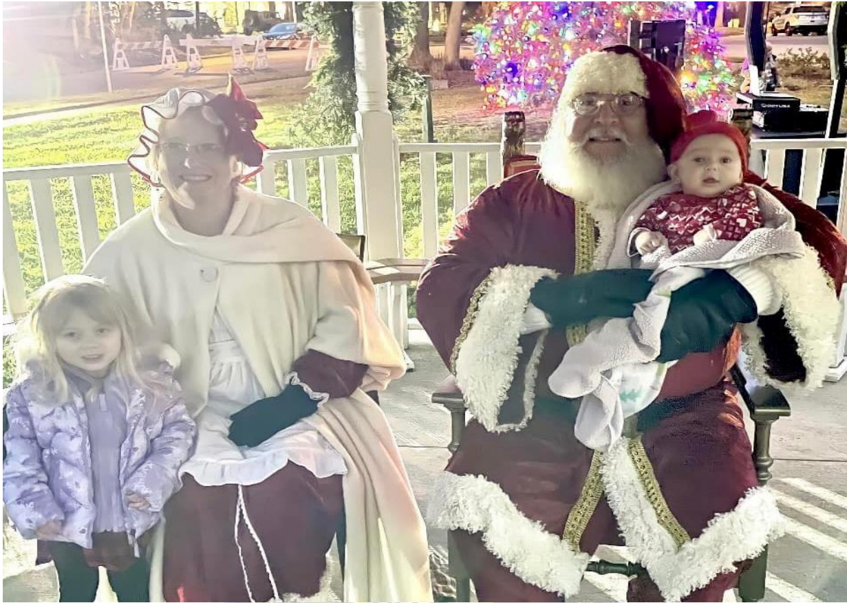
Santa and Mrs. Claus visiting with children