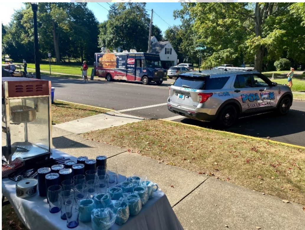
Car 63 set up on Silver Lake Boulevard for the Car Show