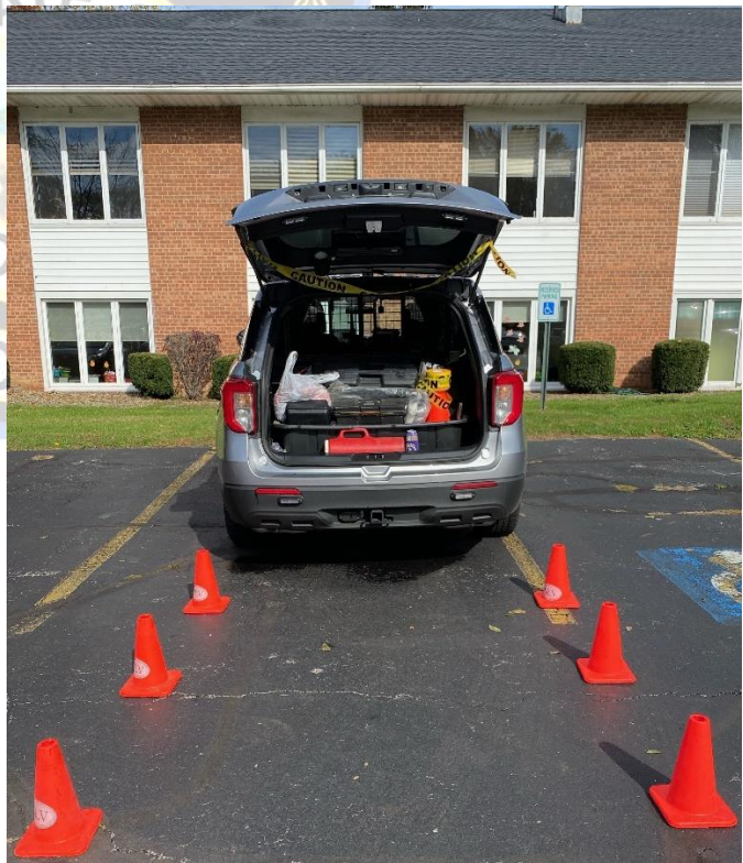
Car 63 ready for Trunk or Treaters