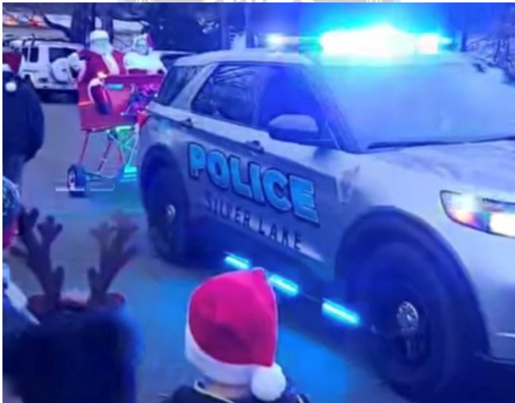
Police Department escorting Santa and Mrs. Claus into the village