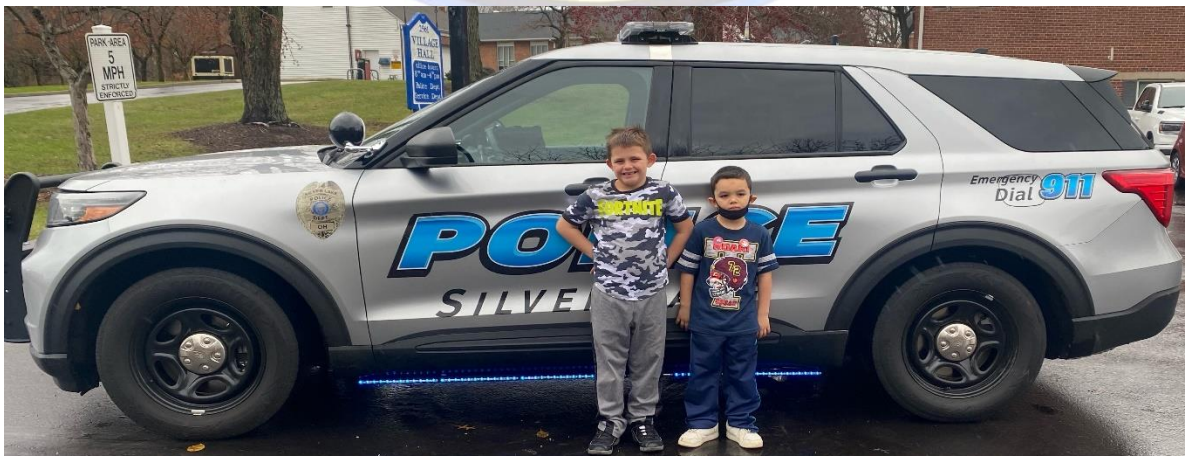
Leaving to have breakfast with Santa