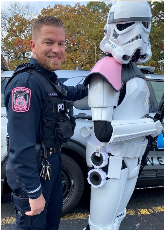
Ofc. Beverage and a Stormtrooper