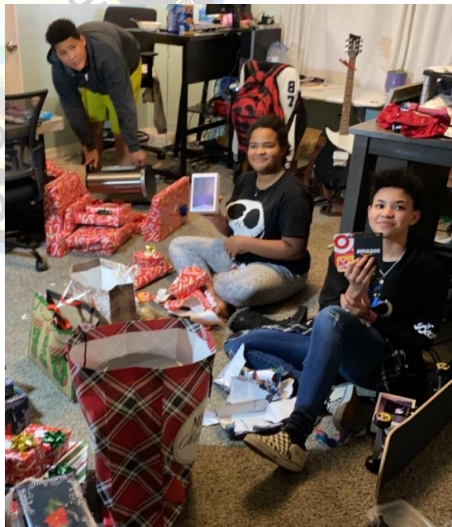
Enjoying all their gifts