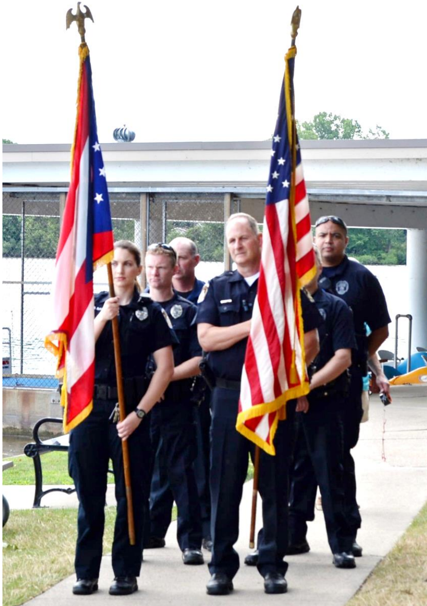
Silver Lake Garden Club Festival

Commitment to the Community and each other as we continue to provide for a safe environment for the citizens and visitors of Silver Lake.