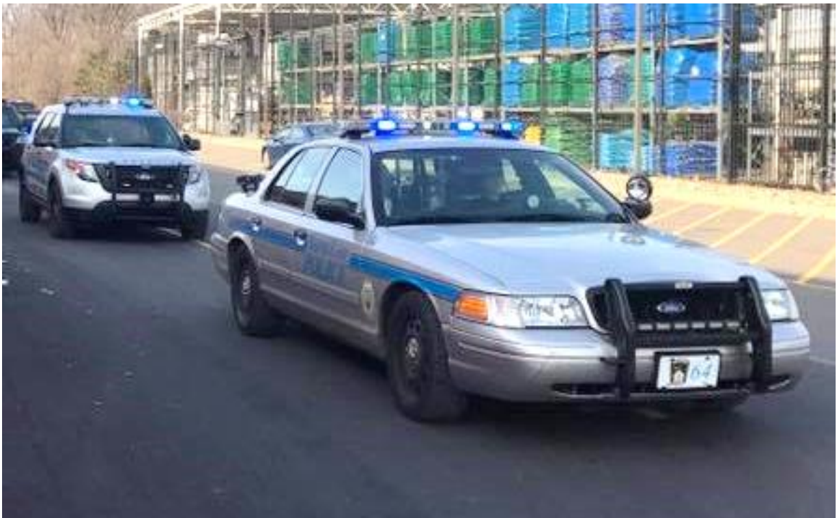
Shop With a Cop