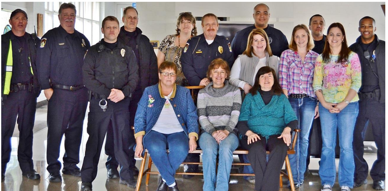
Silver Lake Police Association's Annual Easter Egg Hunt