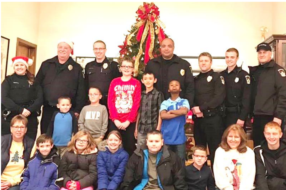
2016 Shop With a Cop