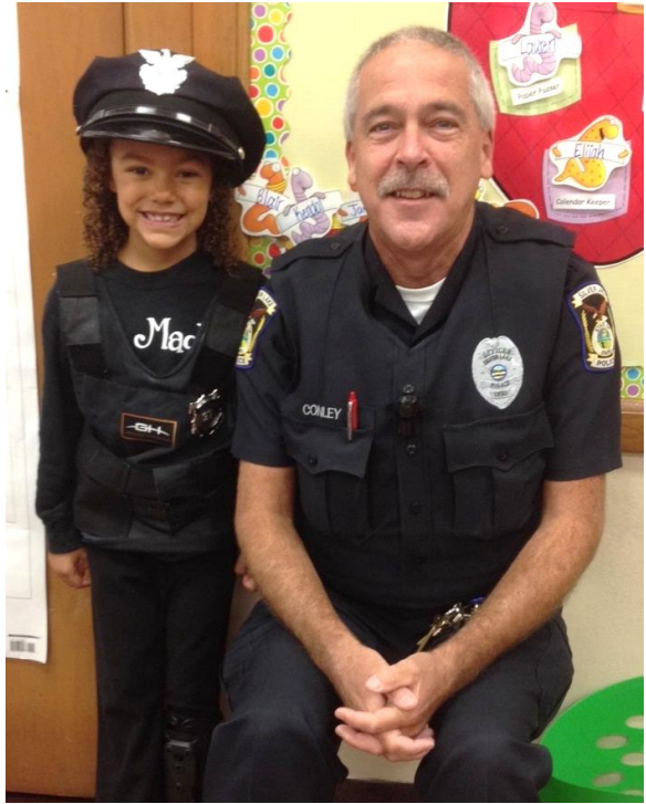
Lieutenant Justice and Chief Conley met future officers at the Silver Lake Elementary Halloween Celebration.