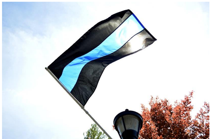
Flag photos compliments of Deidre Pulley

The sun shining through the flag below symbolizes the department's transparency.