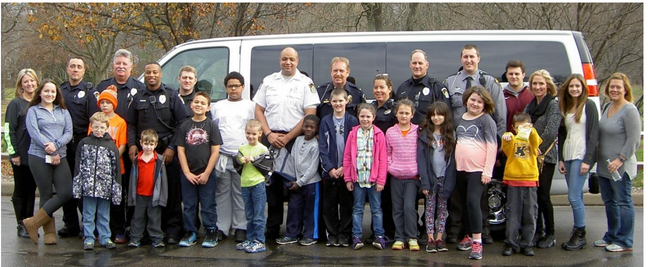
2015 Shop With A Cop