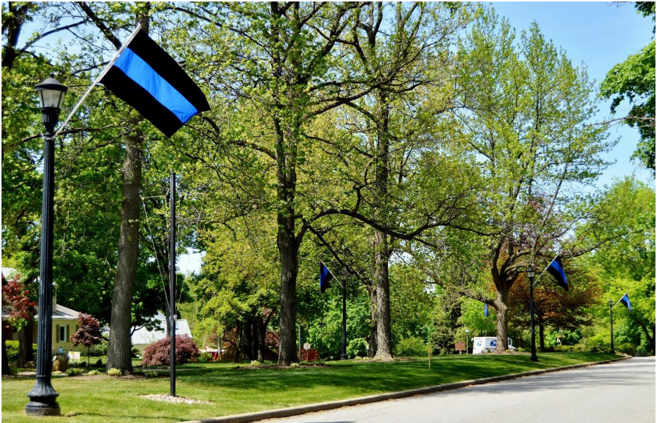
Flags flying on Silver Lake Boulevard in May during Police Memorial Week